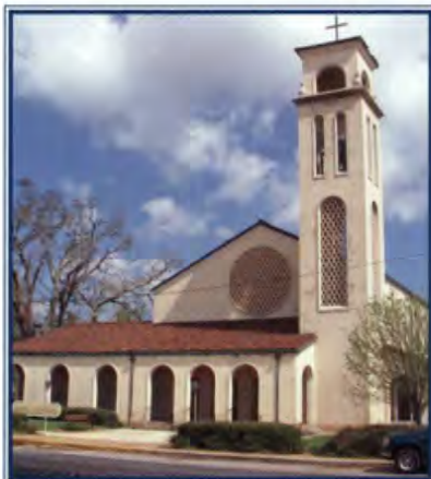
Cathedral of the Sacred Heart, Pensacola.

For more information visit www.ptdiocese.org