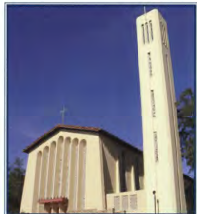
Co-Cathedral of St. Thomas More, Tallahassee.