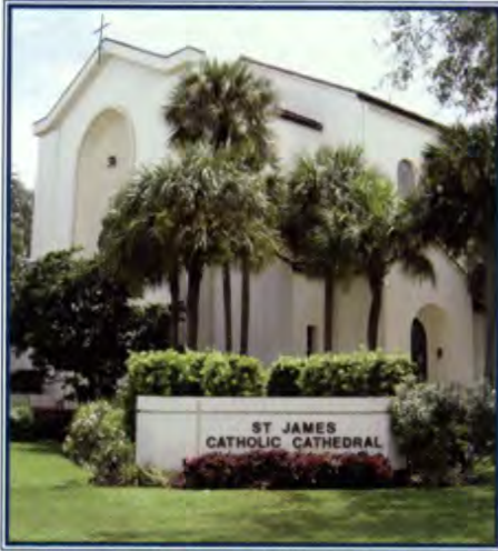
St. James Cathedral.