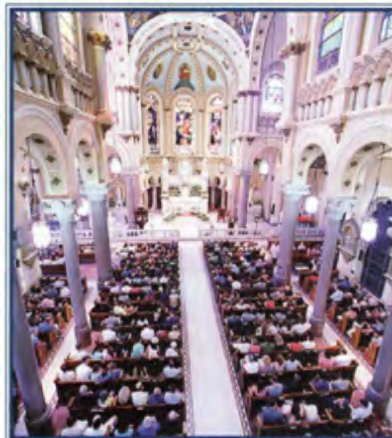
Interior of Sacred Heart Church, Tampa.