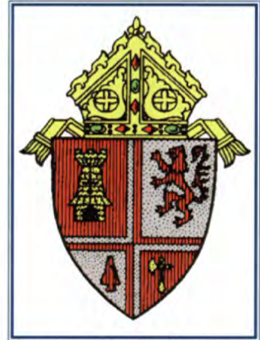
Crest of the Diocese of St. Petersburg.