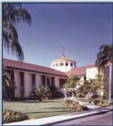
Cathedral of St. Jude the Apostle.

For more information visit www.dioceseofstpete.org